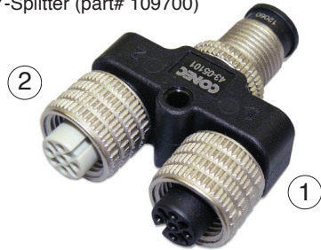
Y-Splitter (part# 109700)

The connections for Leveloggers on the RRL Stations are identified as Right and Left in the RRL Gold Software. This assumes the RRL Station is facing with the black label towards you. When using a Splitter, the number 1 or 2 will identify the Leveloggers. The numbers 1 and 2 are labeled directly on the Splitter.