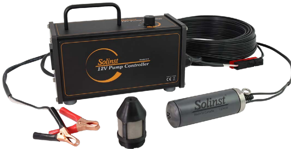
(Optional Water Filter)