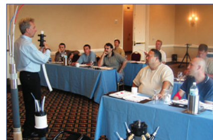
Instructing drilling contractors and consultants on CMT installation techniques at Battelle Bio-Symposium, Baltimore, Maryland.

Please contact Solinst should you wish to attend or set up a training session.