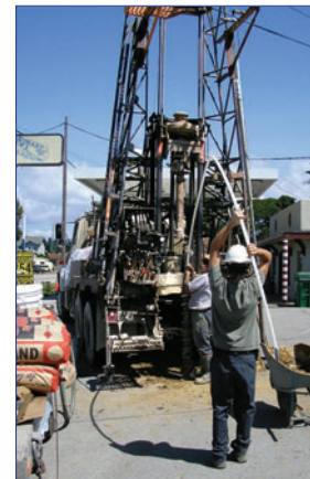
A gas station site in Watsonville, California. Five 3-Channel CMT Systems were installed to monitor gasoline contamination and MTBE plume. Installations were completed within hollow stem augers using bentonite and sand layers to isolate each monitoring zone.