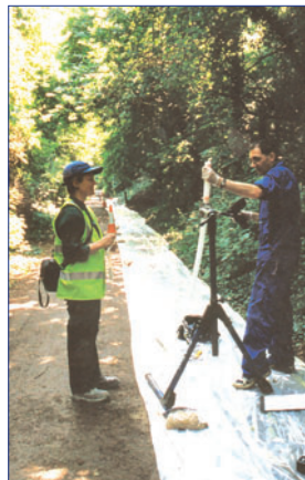
CMT System installed to a 60 m (200 ft) depth with seven monitoring zones. Installation was completed by placing layers of sand and bentonite to monitor a BTEX/MTBE plume in a Chalk aquifer, United Kingdom.