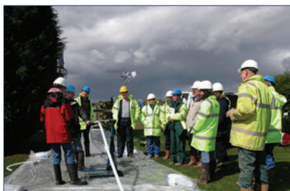
CMT Installation and training as part of a "Multilevel Course" given by the University of Cranfield at Silsoe, U.K., in conjunction with Waterra (UK), British Geological Survey & Norwest Holst.