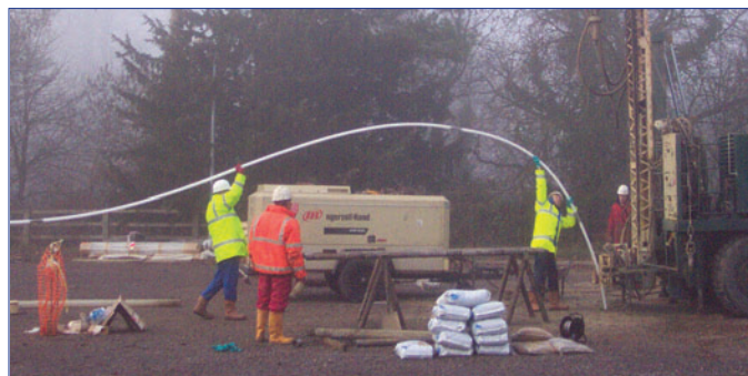
CMT Installation at UK Chlorinated Solvents Site

These cartridges are approximately 2.4" (61 mm) in diameter and will fit inside various direct push drill rods. Ideally, the borehole diameter these bentonite cartridges are used in should not exceed a nominal 3.5" (90 mm), to ensure proper expansion and sealing.