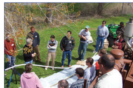
Outdoor installation/ demonstration at premises of Parrat-Wolff, Environmental and Geotechnical Drilling Services, Syracuse, New York.