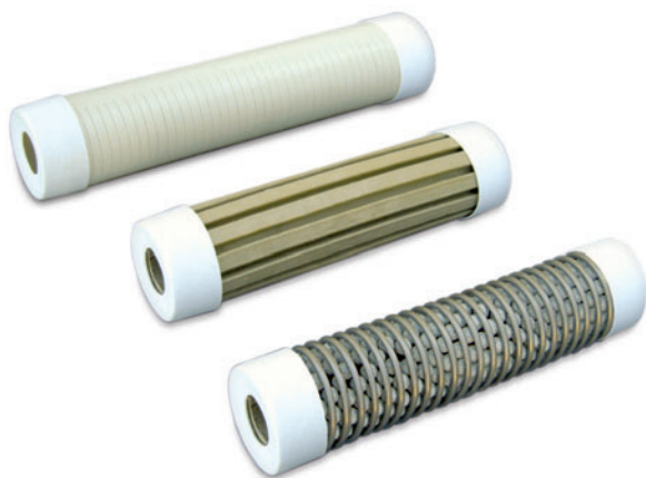
3-channel CMT Sand and Bentonite Cartridges

The CMT can be installed using standard sand and bentonite layers placed via a tremie pipe, or poured directly from the surface. The Model 103 Tag Line is ideal for accurate placement of sand and bentonite during borehole completion. If the installation is in loose sands, natural collapse can be used, allowing the sand to collapse around the tubing.