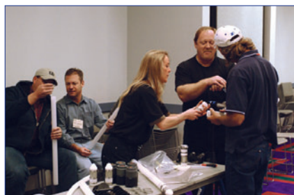
The first CMT contractor training course, conducted at the NGWA Expo in Las Vegas, December 2004. Contractors are being instructed on proper port construction.