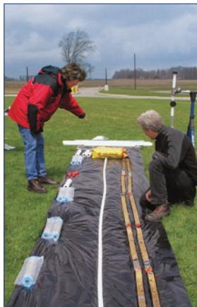
Installation of a 3-Channel CMT System with bentonite and sand cartridges. Three zones were monitored over a 20 ft (6 m) depth. The installation was completed in glacial till at the University of Waterloo, Ontario Canada.