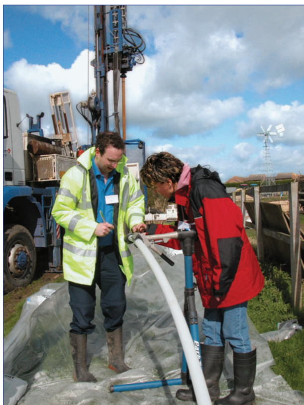
Construction of CMT ports in a 7-Channel system installed in Silsoe, England.

Two systems are available. The 1.7" (43 mm) OD polyethylene tubing, segmented into seven channels, allows groundwater monitoring at up to 7 depth-discrete zones. The 3-Channel System uses the same material and construction, but it is only 1.1" (28 mm) in diameter. This narrow tube was developed for smaller diameter installations, especially direct push where the annulus for seal placement is narrow.