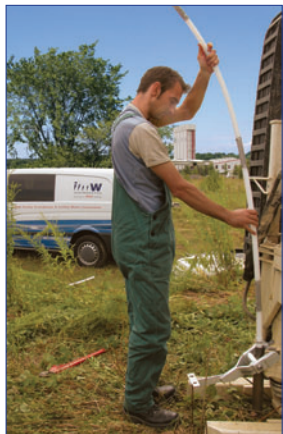
3-Channel CMT installation at a plant in Zeitz, Germany. Systems were completed using natural collapse and are being used to assess natural attenuation of BTEX.