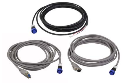
Connector Cables for Communicating using SDI-12 and MODBUS RS-232/RS-485 Protocols